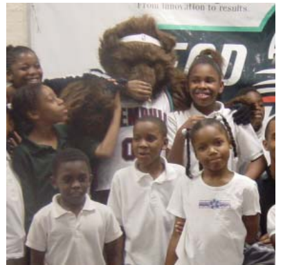
Grizz has a good time visiting Streets in February

Streets Ministries would like to thank Danka Copiers of Memphis for their printing services.