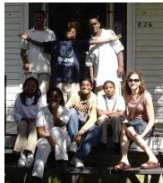
Streets on the front porch of Slave Haven