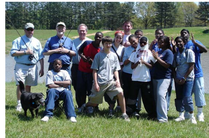
Members of the Mid-South Fly Fishers Association pose with our group from Streets

As you might imagine, the kids who come to Streets do not get to spend much time away from the concrete and chaos of the city. Positive new life experiences are few and far between, so it truly a wonderful thing to see our kids get excited about doing something they had never done before while taking in all the calmness nature has to offer.