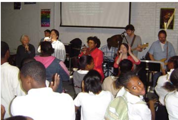
HeartSong leads a group of 60+ club kids with songs of praise and worship.