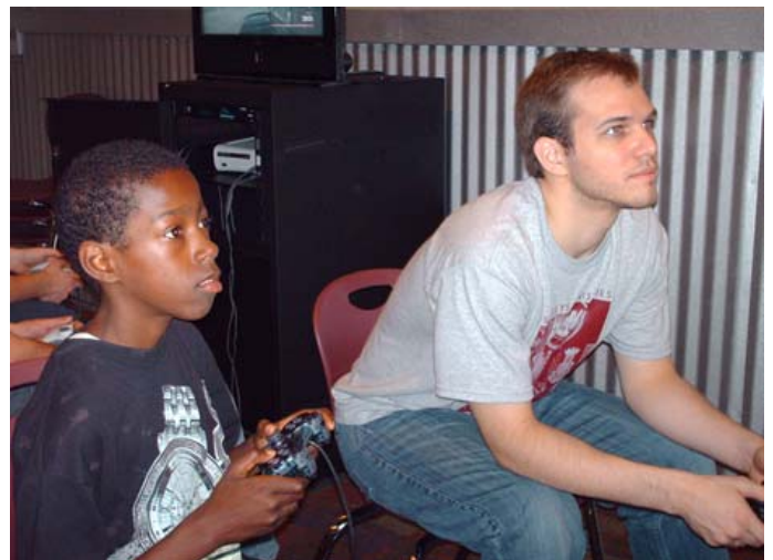
During a recent "38126 Weekend", Mississippi State RUF students received X-Box lessons from Streets kids.