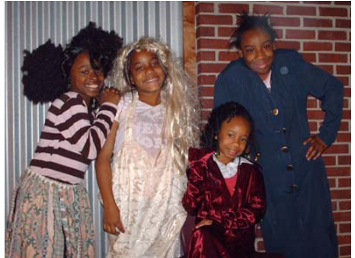
As a part of a recent "Elementary Explosion" VBS, Georgia Avenue Elementary students participated in skits.