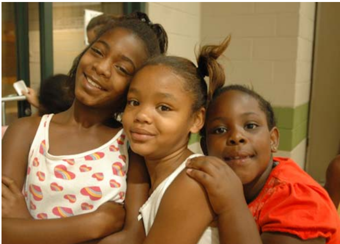
Saturday Morning VBS: Georgia Avenue Elementary and Downtown Elementary students enjoying activities during a recent VBS.