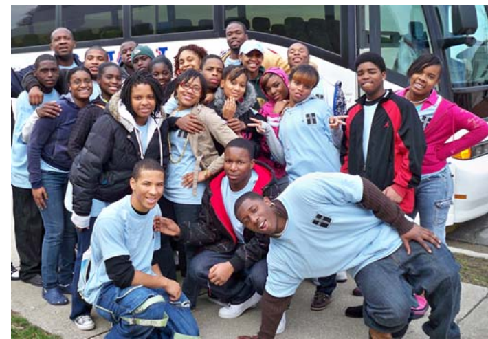
All Aboard: Forty-three students from both Streets Downtown and Highland Heights prepare to embark on College Tours 2009.

In both instances, before the tour, college was something these young men had only heard about and never imagined it could also be something they could take advantage of themselves. College Tours changed that perspective. While on tour, students see all kinds of schools. Big, small, public, private, historically black, etc. Each time, students are amazed at how beautiful the institutions are, and they leave really wanting to go to college one day. Now let us fast forward a few years to spring break 2009.