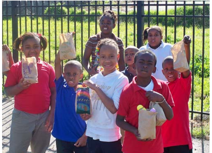
Egg Hunt: Streets Smarts students during a recent Easter egg hunt.