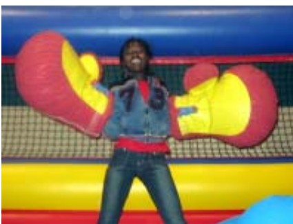
Presenting the Ladies Lightweight Boxing Champion of the IPC Middle School Lock-In