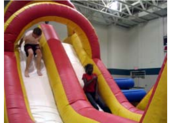
Fun and Games at the IPC Lock-In