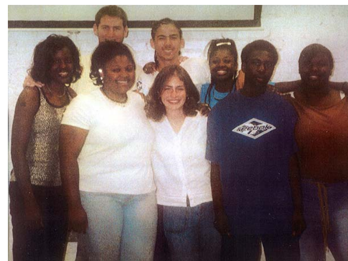
Streets Summer Institute, Class of 2003