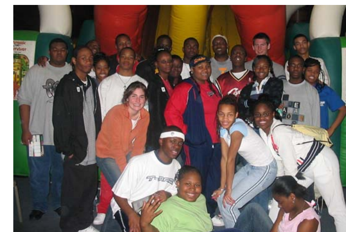
After a full day on college campuses, College Tours stopped to play in Atlanta

This college tour trip was the most awesome experience I've had this year. I would love to thank Streets Ministries for offering me the opportunity to become familiar with those wonderful colleges and universities. I must say that I've learned a lot about colleges and universities through this trip. I'm definitely looking forward to the next tour in the spring of next year.