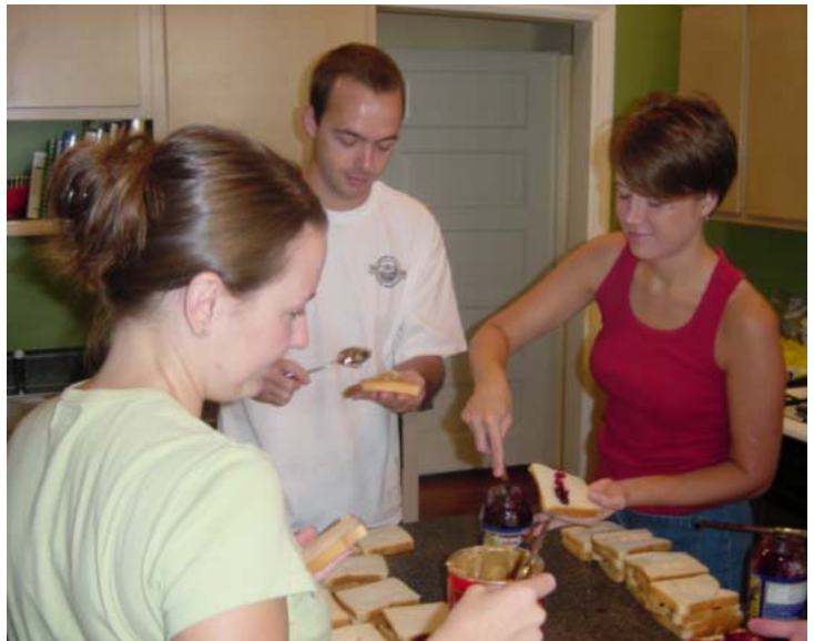
Volunteers prepare lunches for our summer work crews.